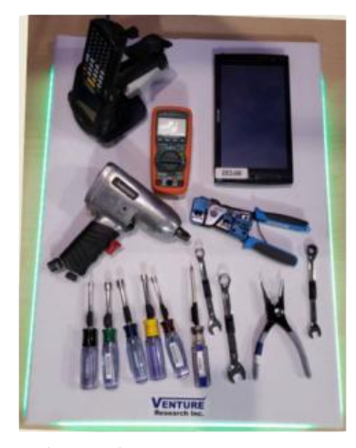
Tagged tools can also be used on Venture Research Surface Readers